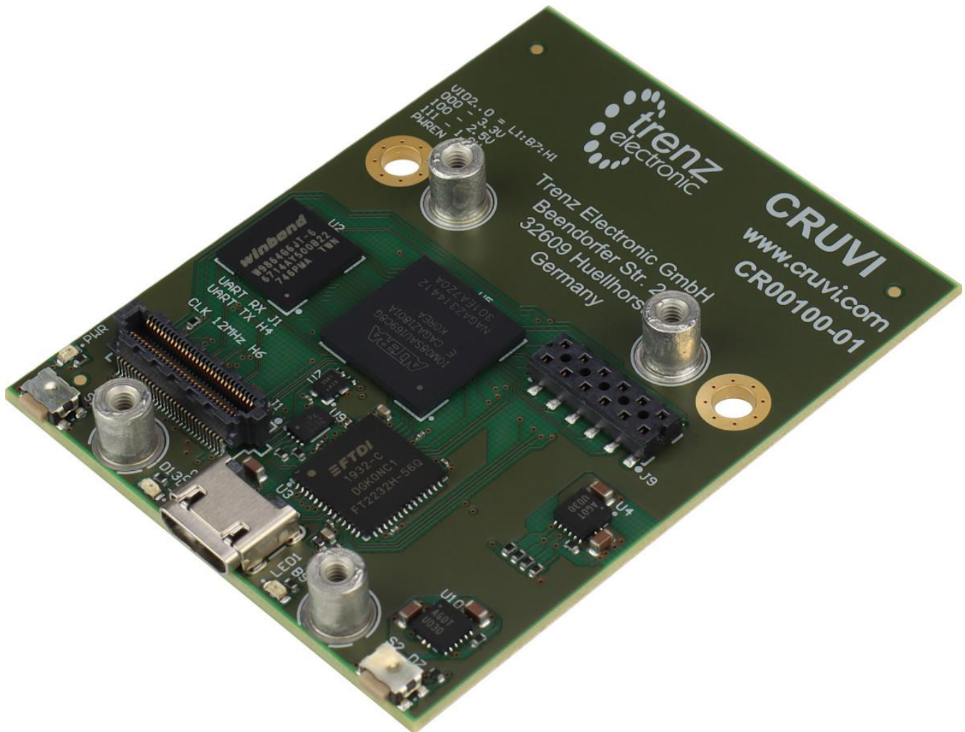
FIGURE 2 CRUVI CR00100-01